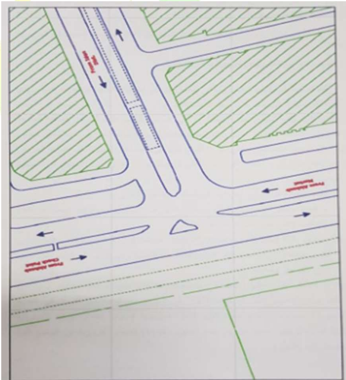
Shape(2)Geometric Diagram Of Aden Intersection Before Diversion Into A Bridge Intersection (8)

intersection into a bridge as in Figure (4), which created a radical change in the performance of the intersection in terms of the flow of traffic at the intersection and reducing the waiting time in a manner commensurate with the goal assigned to this intersection.